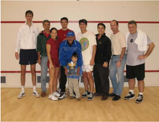
Group Pic at the end